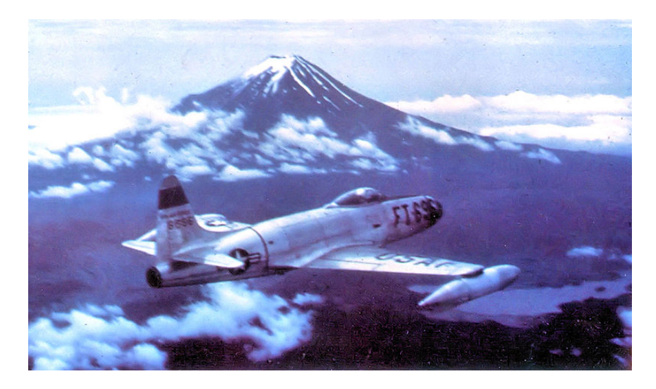
35th Fighter Squadron F-80C near Mt. Fuji, Japan in 1950. (Air Force Photo)

PB-2A of the 35th Pursuit Squadron, 8th Fighter Group at Langley Field, VA, ca. 1936-1939. (Air Force Photo)