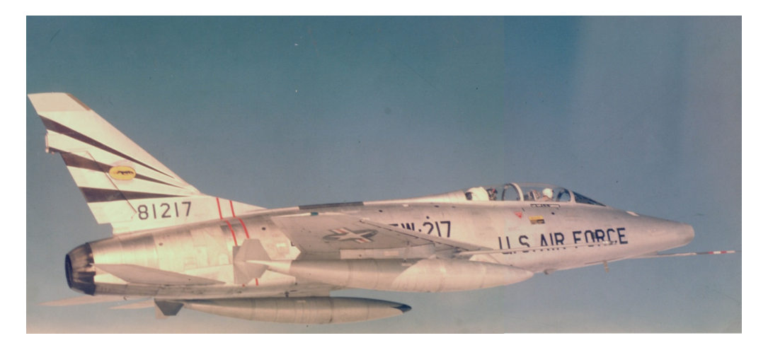
F-100D Super Sabre of the 35th Fighter-Bomber Squadron.