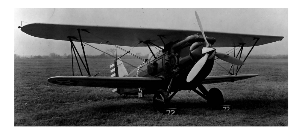
35th Pursuit Squadron P-6 at Langley Field, Virginia in the mid-1930's