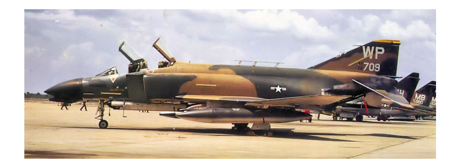
35th FS F-4D at Ubon Air Base, Thailand – Date Unknown

Air Force Order of Battle Created: 25 Oct 2010 Updated: 5 Feb 2019