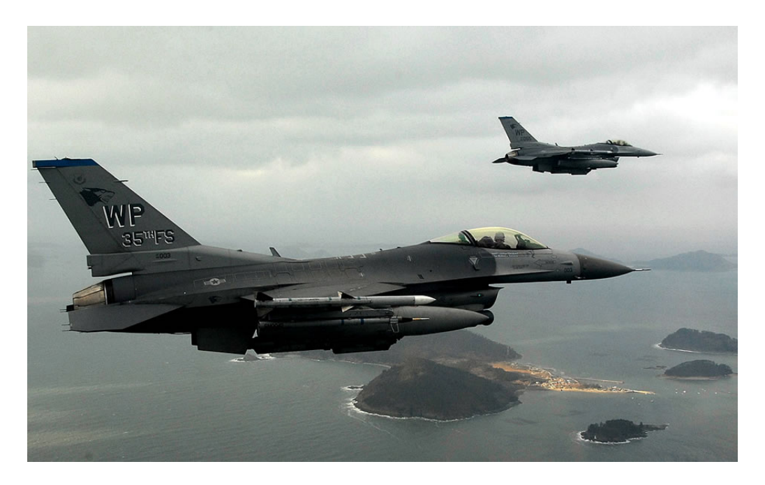
35th Fighter Squadron F-16's over Korea on January 30, 2008