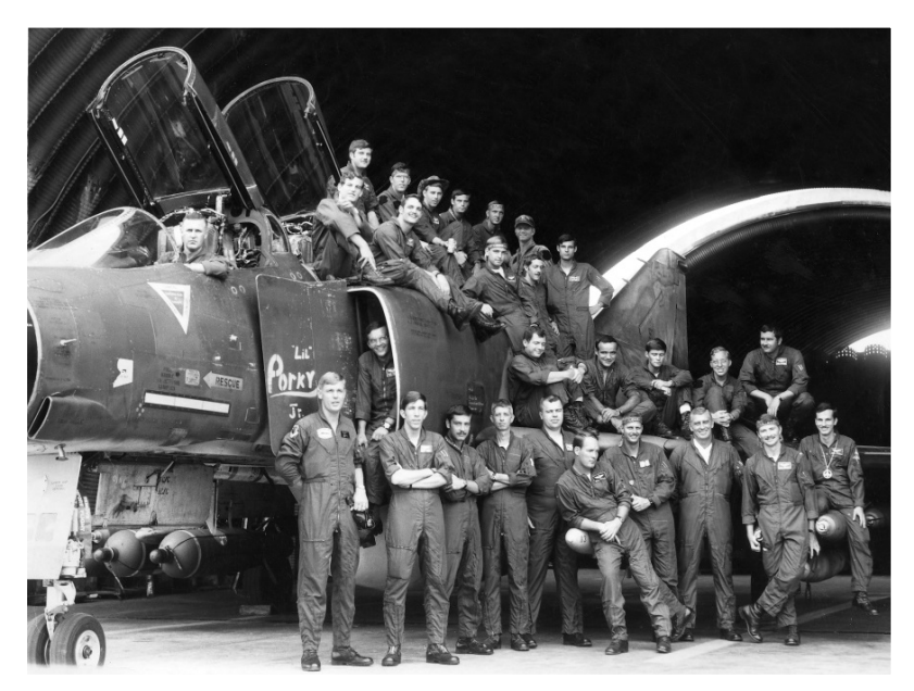
Figure 1. 35th Tactical Fighter Squadron pilots pose with an F-4 Phantom at Da Nang AB, South Vietnam in May 1972 (Air Force Photo)