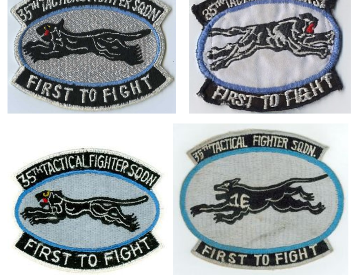
35<sup>th</sup> Tactical Fighter Squadron emblems

35<sup>th</sup> Fighter-Bomber Squadron emblems