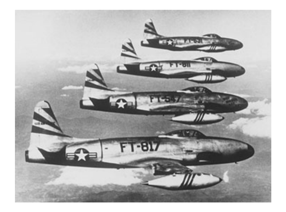
35th Fighter-Bomber Squadron F-80 Shooting Stars over Korea in 1950